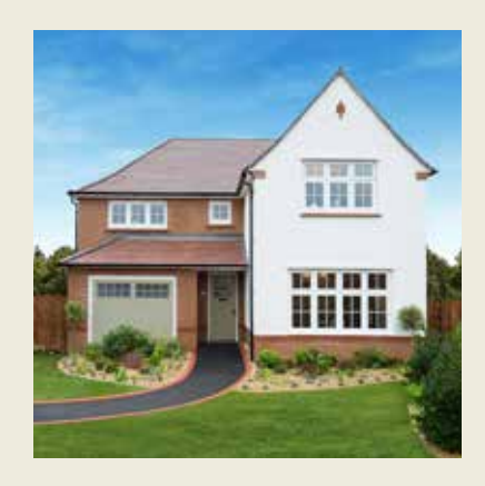
SUNNINGDALE GREEN Herne Bay, Kent CT6 7PG

01227 213 484 sunningdalegreen@redrow.co.uk