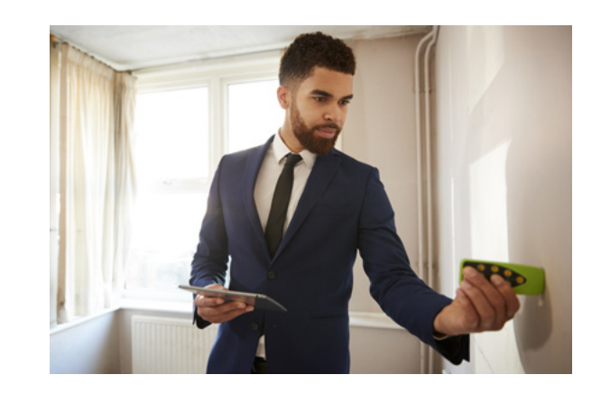
Type 3: Building survey. For £600+, this is the most detailed survey for residential properties, with the surveyor inspecting all parts of the property including chimneys, attics, cellars, walls and under floors. It is ideal for properties that are older, listed or intended to be renovated extensively. The report lists the defects and advises on any repairs and maintenance that should be made.

Type 2: Homebuyer report. Costing around £400, this more in-depth report highlights issues that could affect the property's value and ongoing maintenance, such as damp or subsidence. It will only cover what is initially visible to the surveyor. You may also have the option for a valuation to estimate the value of the property on the open market. If this figure is lower than your offer, this could provide evidence for reducing your offer.