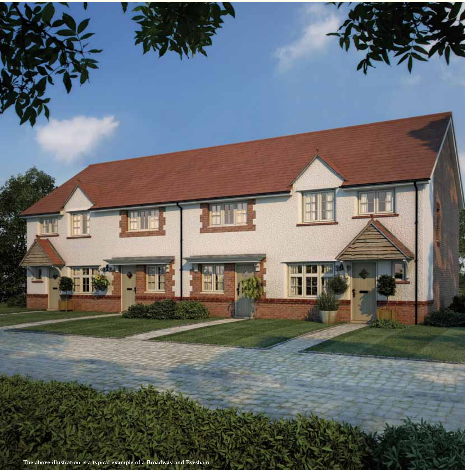
The above illustration is a typical example of a Broadway and Evesham.