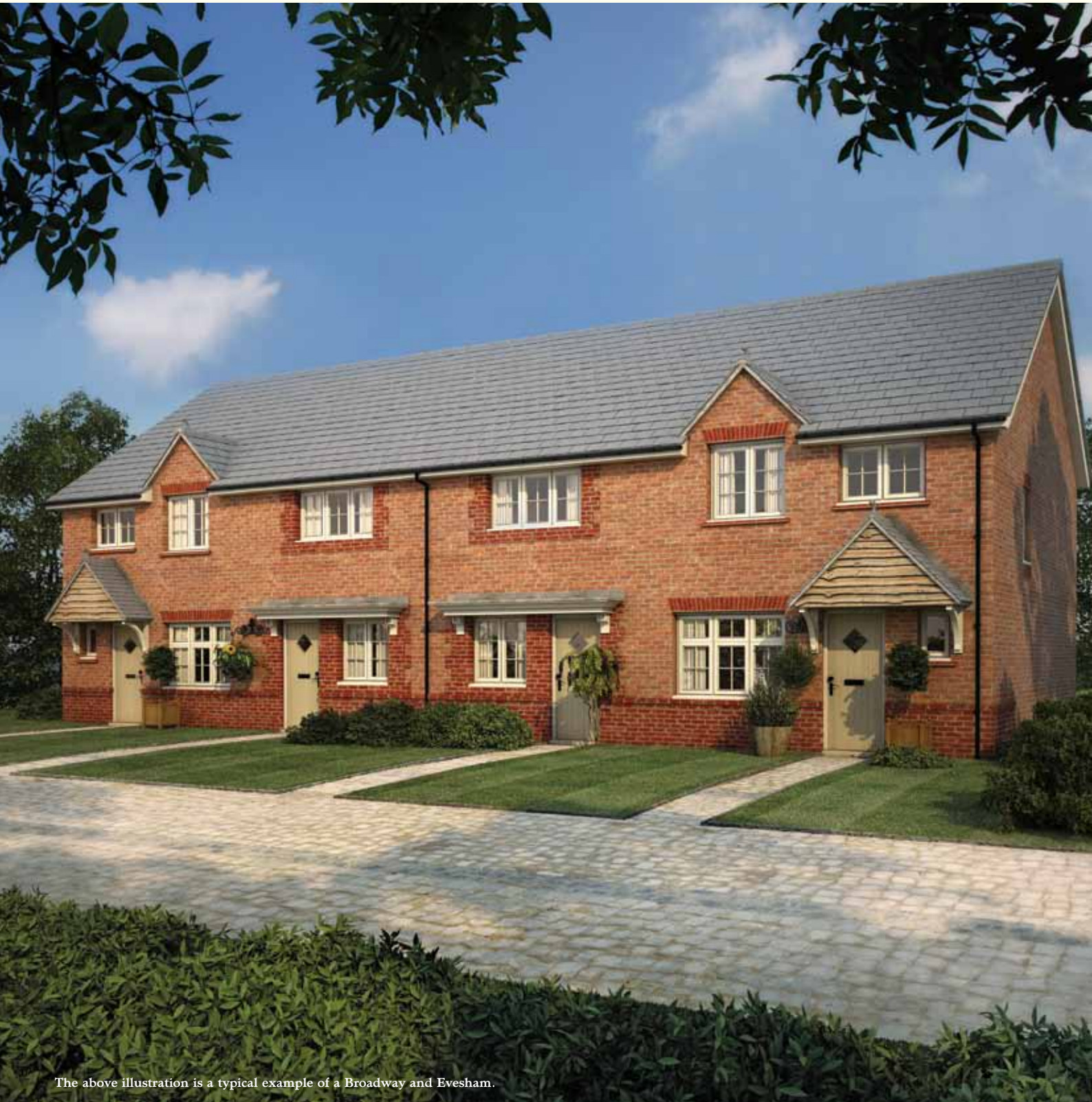
The above illustration is a typical example of a Broadway and Evesham.