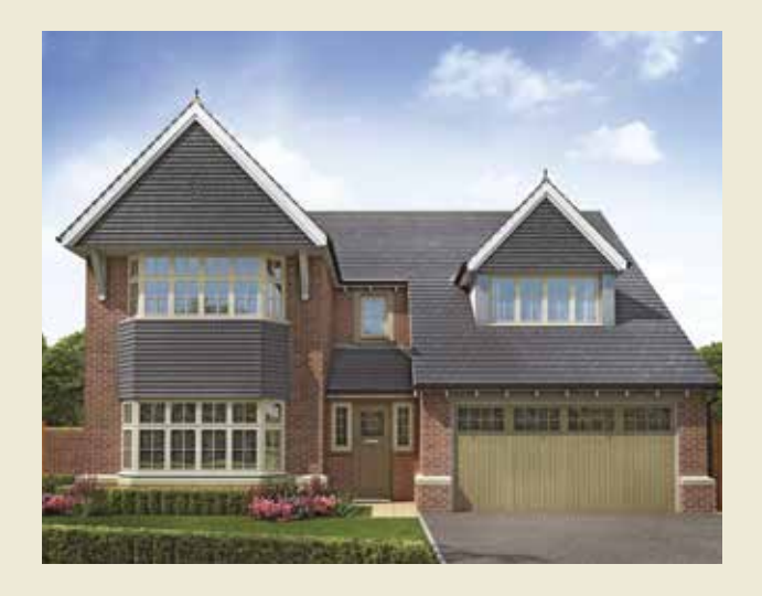
PLOTS 10,12,15,19,44,46,49+52 | 1901 SQ FT

An extensive executive home of real substance, The Marlborough creates a first impression that lasts, from its traditional wide bay windows to the spacious integral double garage and the stunning entrance in between.